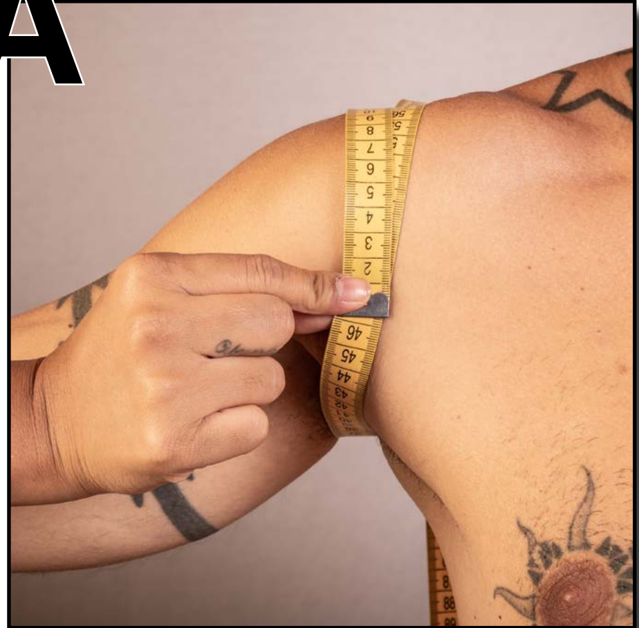
Raise your arm and take shoulder circumference, allow a finger in between