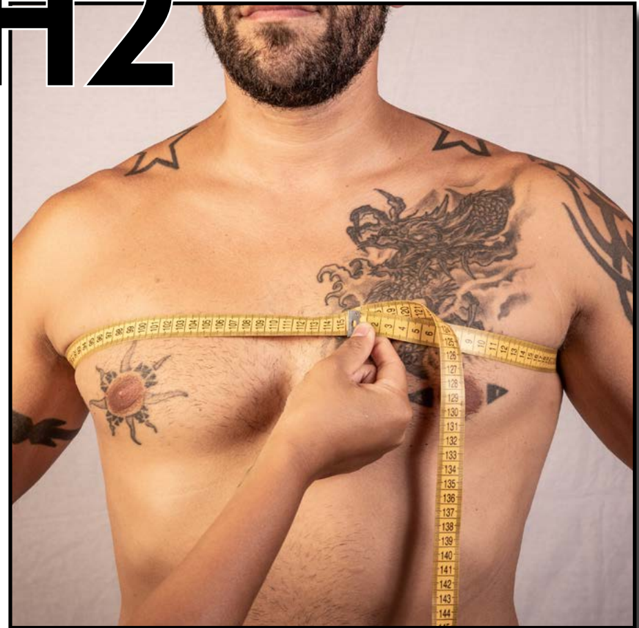
Chest circumference right below the armpit, keep a finger in between and breath normally