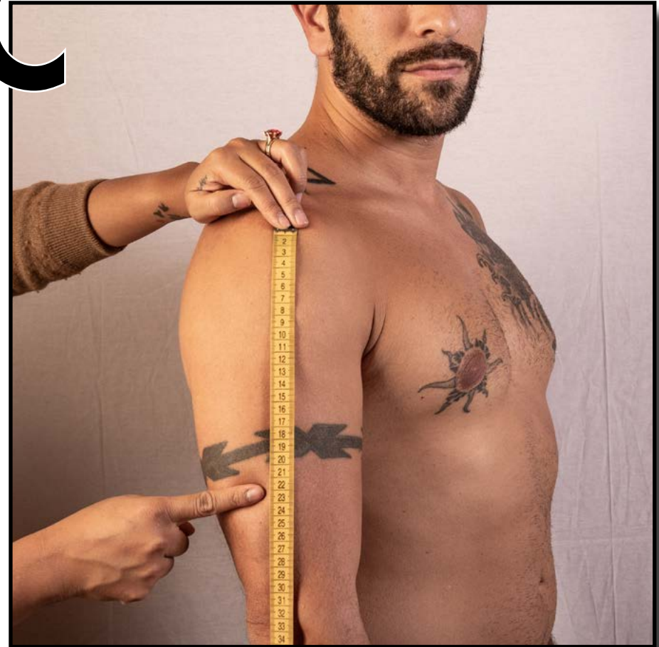
SUMMER SUIT: from end shoulder to desired sleeve length