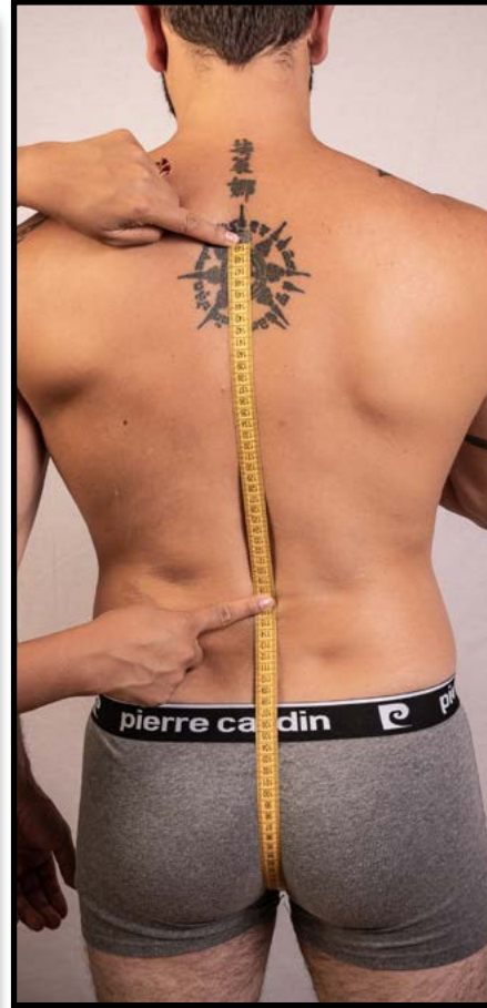
Make sure there is no free space between the tape and the body in the crotch area (don't pull either too much) and along the back.