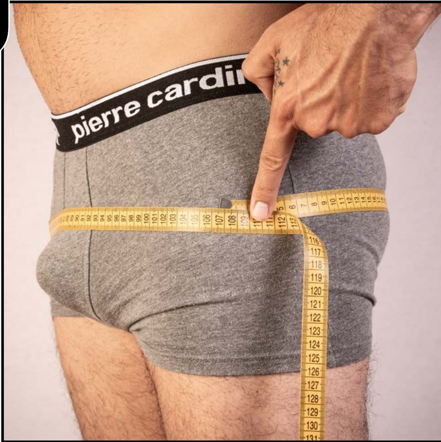
Hips circumference at widest part