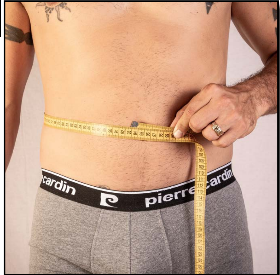
Waist circumference for MAN, at bottom belly level. Breath normally and keep a finger in between body and meter