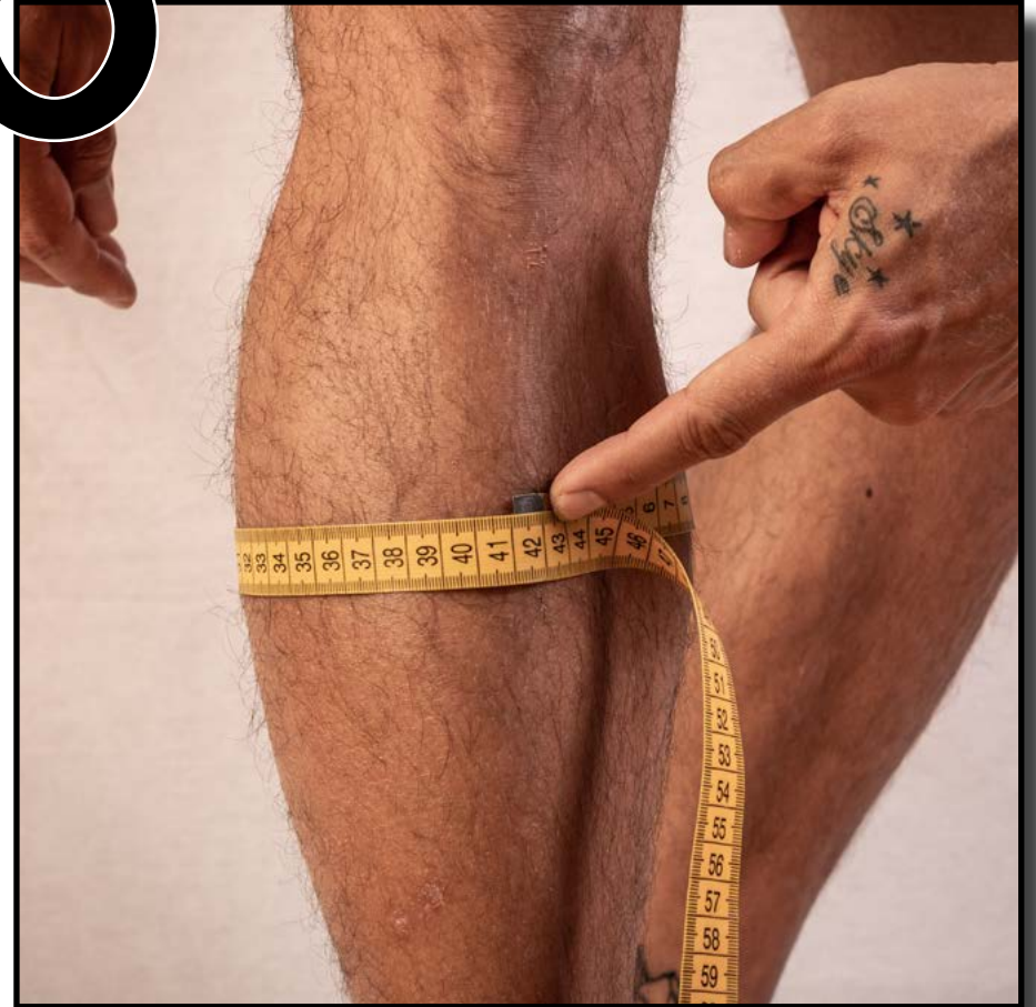
Calf circumference, widest part