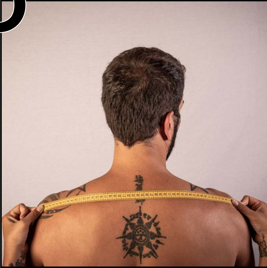
End to end shoulder