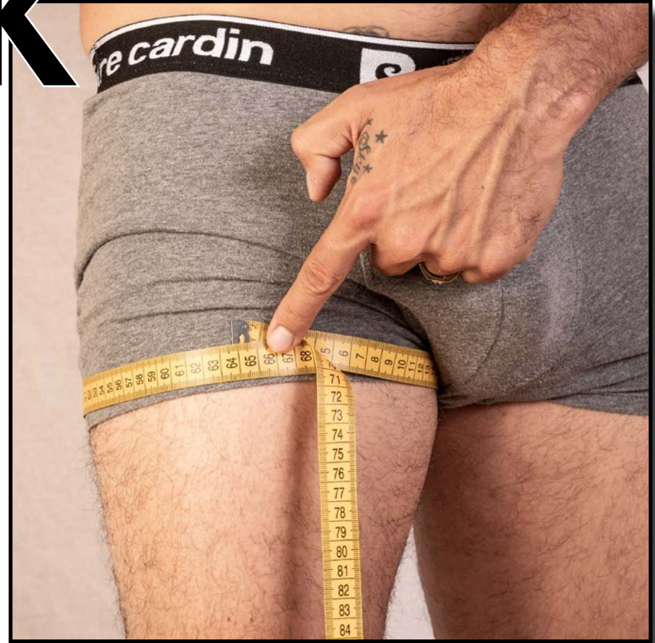
Thigh circumference at crotch level