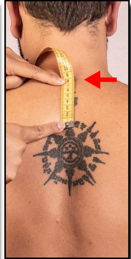
If your measuring tape is not long enough, just continue from the point where you ended and add up both measurements.