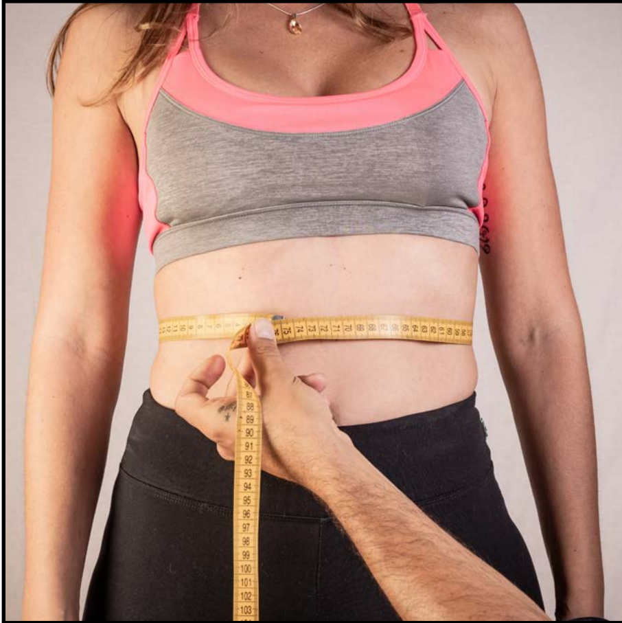
Waist circumference for WOMAN, narrowest part. Breath normally and keep a finger in between body and meter