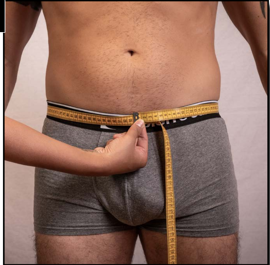
SHORTS & PANTS: Waist circumference at belt level