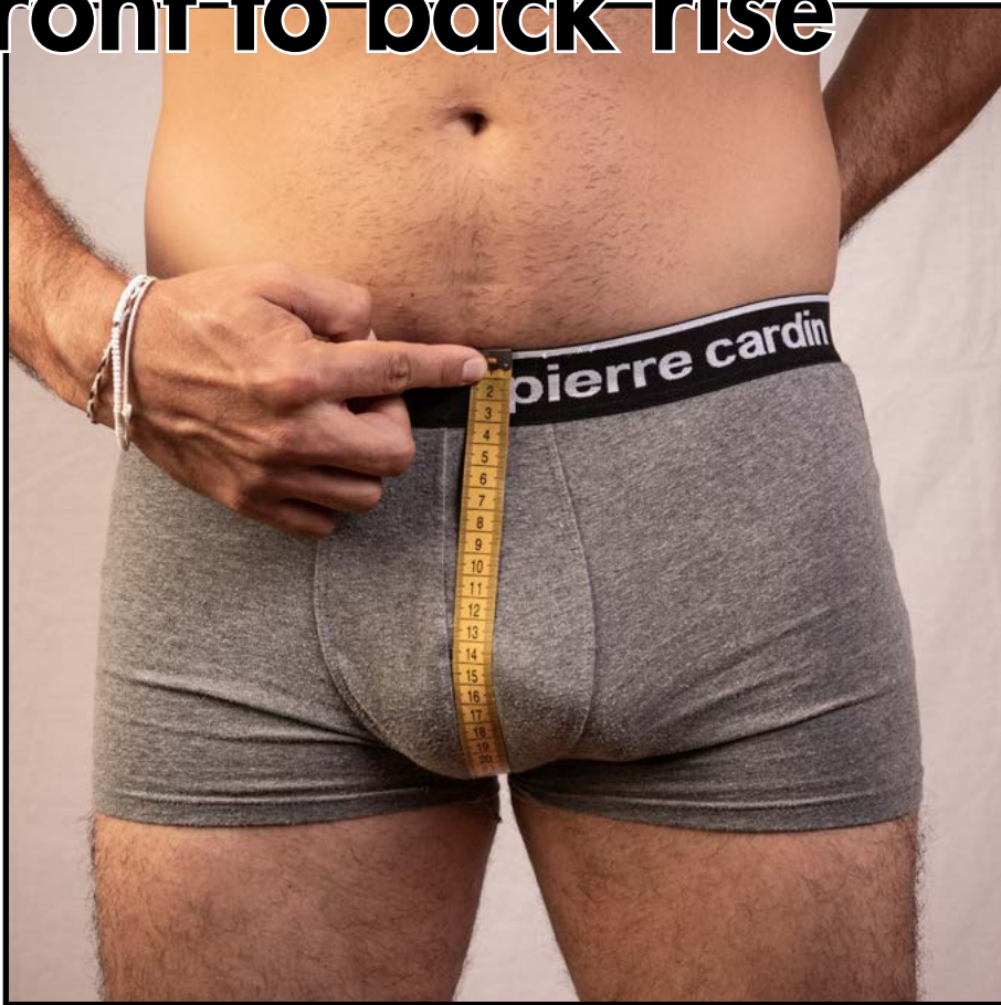
Front to back rise