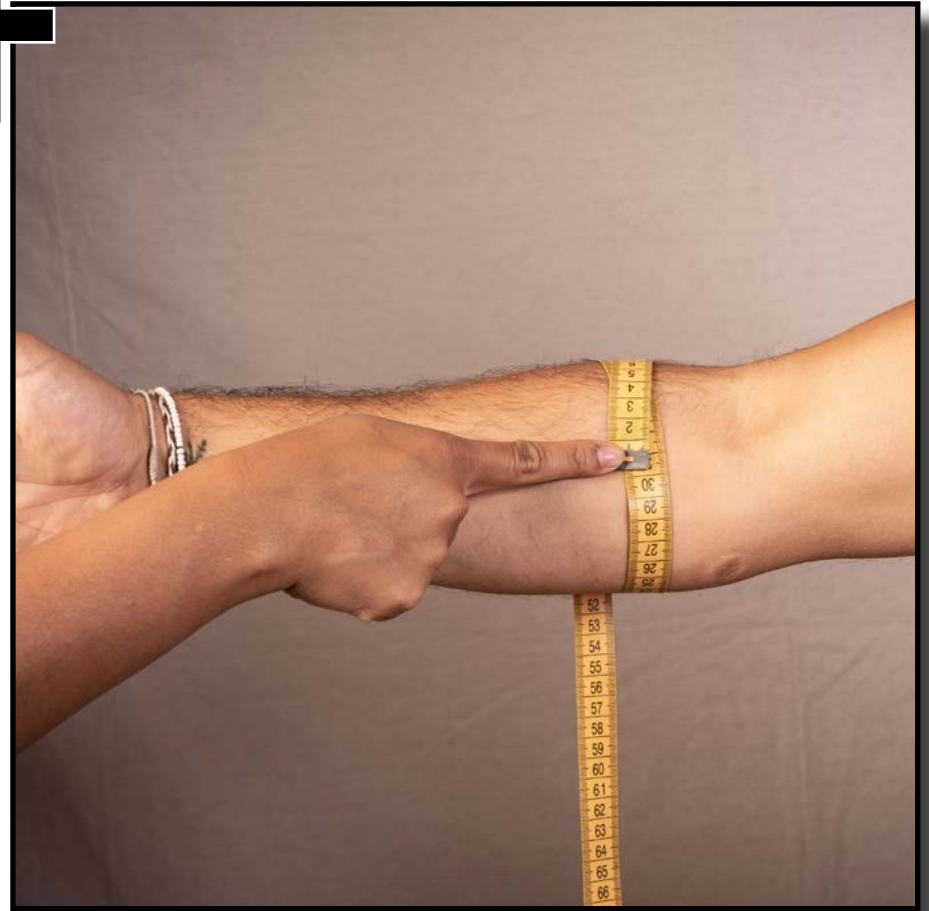
Forearm widest part