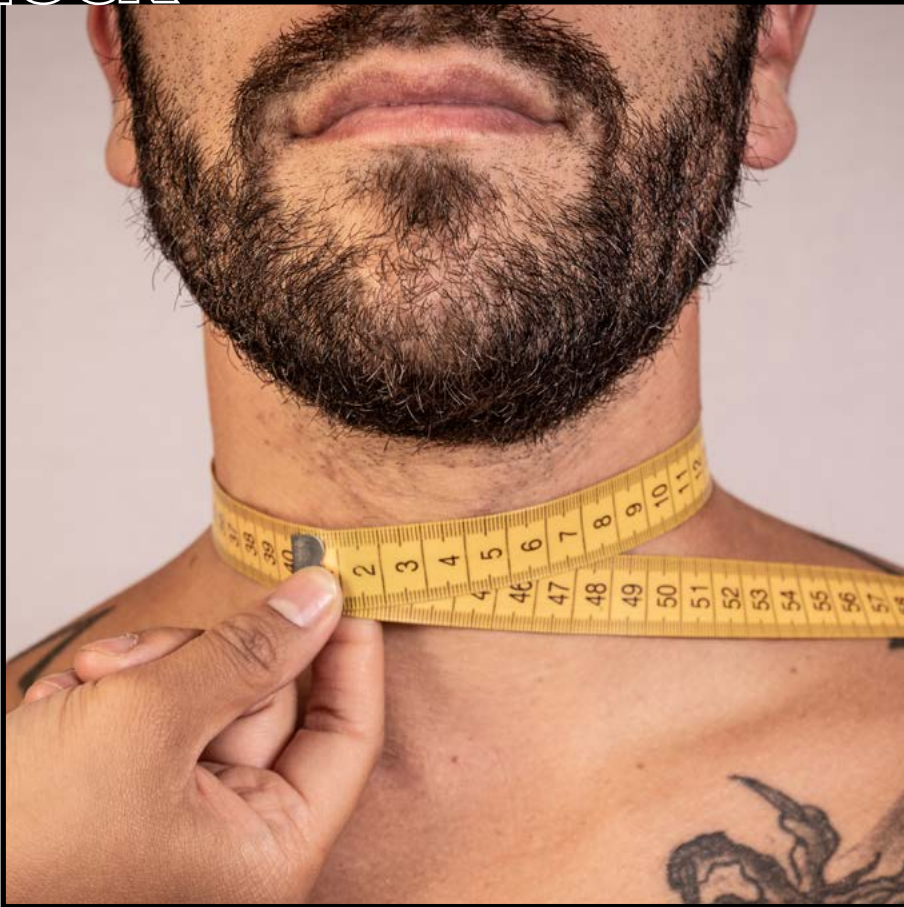
Neck circumference at Adam's Apple level, keeping a finger inbetween