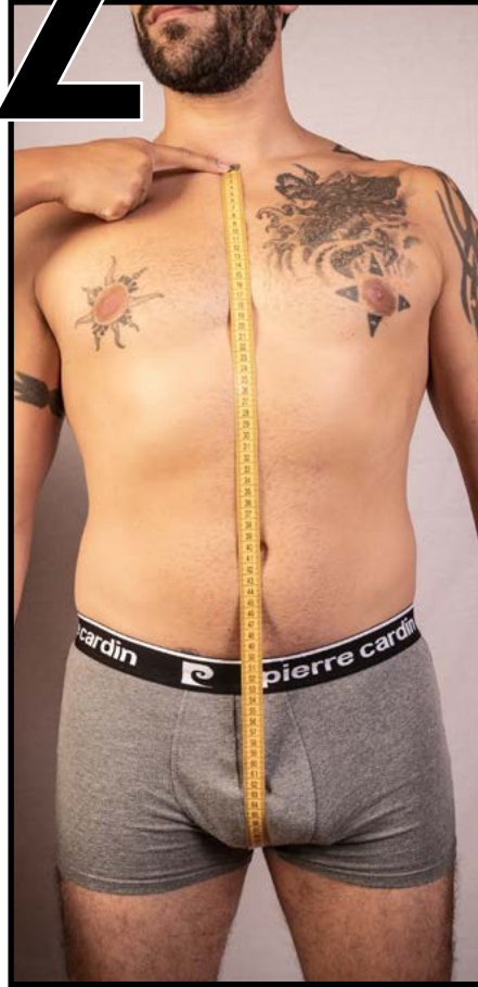
Measure the torso starting from the jugular notch, underneath the crotch and up the back to the bone at the base of the neck.