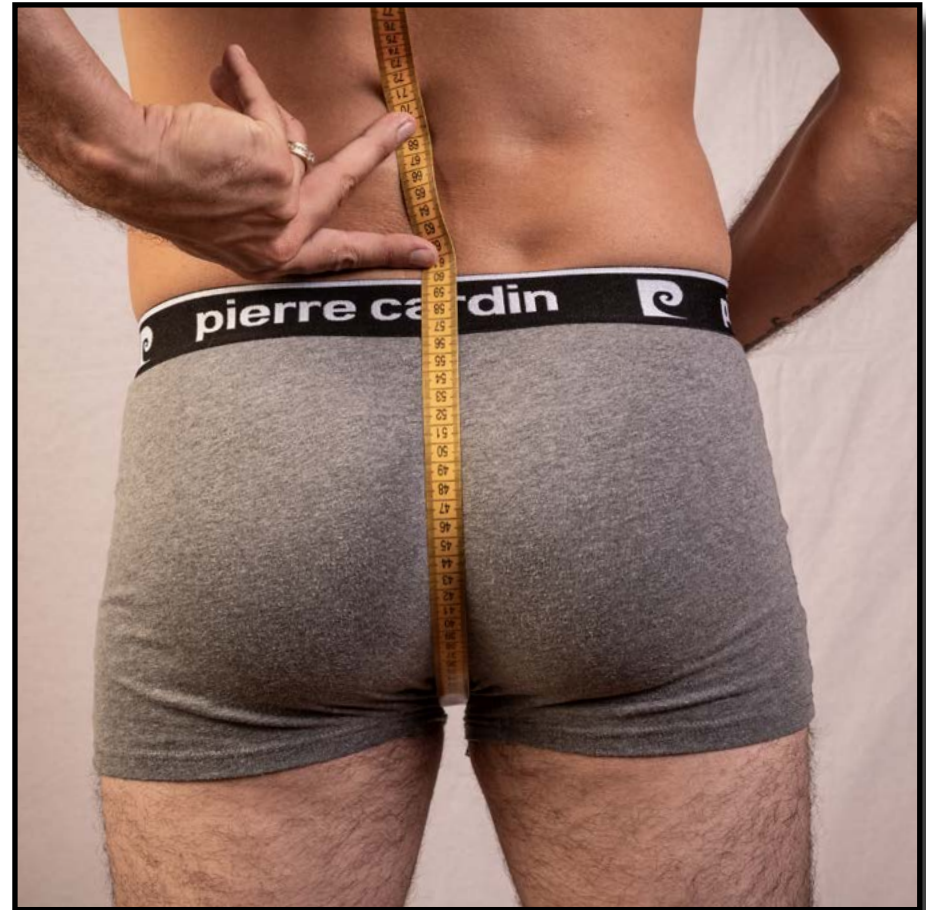
Take measure at belt level

In case of uncertainty please reach us out anytime.