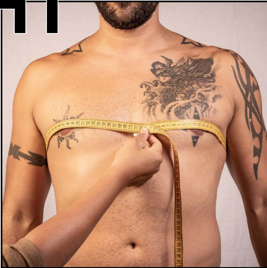
Chest circumference at nipples level, keep a finger in between and breath normally